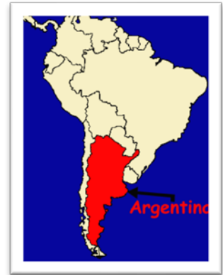
UWEC Students Argentina Panel

Monday, October 7 4:00 p.m.-5:30 p.m. Centennial 1415