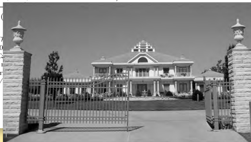
A Maharishi Sthapatya Veda House (June 2009).